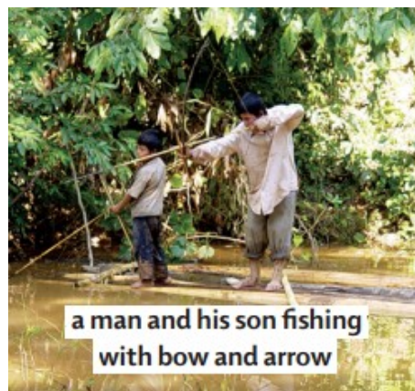
a man and his son fishing with bow and arrow